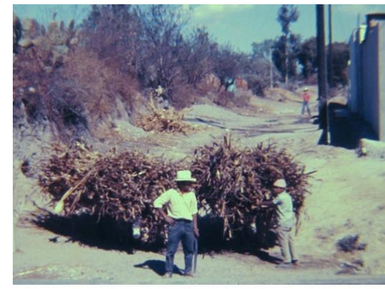
A father and son with their two hard-to-see burros carrying firewood in a small village.

The burros fascinated me. A simple beast of burden was a valuable asset here. They idly hung around until needed, and then they became a pack animal, transportation or whatever else within these creatures' unique capabilities. The scenes could have been from the 1800s if the occasional pickup were removed. I've been in a couple of third-world countries so the scenes were not shocking, just there again. For Bonnie, it was like being on a different planet—she was a long way from the