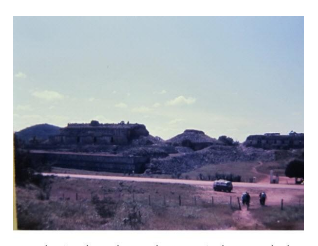
Road going through Uxmal. My van is shown parked.

The ruins here and elsewhere were impressive enough, but to understand all the Mayan gods in this polytheistic culture was beyond our interest. However, one god, Kukulkan , who was in charge of governing, agriculture, the sky, and earthquakes, seemed to be the most popular. Many representations of him—an imaginative feathered serpent—were carved out of stone, embellished with two heads, and having long, curved tongues. The symbols for Kukulkan were numerous and the easiest to recognize at most sites.