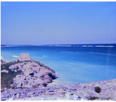
Picture from the rocks, at the bottom of the temple, overlooking the Caribbean in the Tulum ruin.

Unconcerned about the time, almost forgetting we don't have a van to conveniently drive and sleep in, we