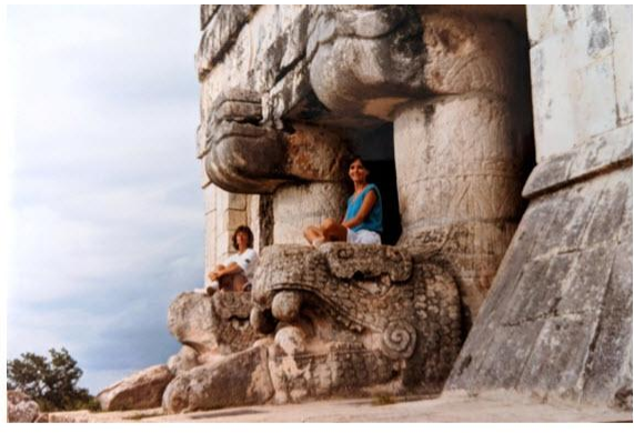
Uncannily, 20 years later standing in the same position I took this picture of my sister, foreground, and wife, background.

When I was going through my old pictures, I was surprised to realize one picture was similar to a picture I took around twenty years later. It was of my sister and wife, when they, my