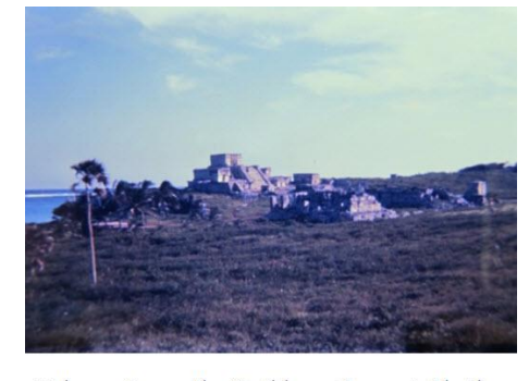
Tulum ruins on the Caribbean Sea, outside the village of Tulum.

overstayed our visit. After making our way to the village of Tulum, we heard there were no buses leaving until the next day, and taking a chance on hitchhiking this late in the day, with very little traffic even during the day, wasn't smart. Unable to find a return trip to Vincent's, we entered the nightly cycle.