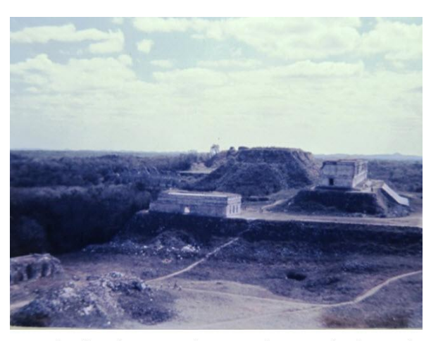
Uxmal with paths among the ruins. The center background shows unexcavated ruins.

The next ruina we visited was Uxmal, about fifty miles south of Merida. With the road dissecting Uxmal, it was easily accessible. The picture shows a contrasting example of restoration and unexcavated ruins at the same site.