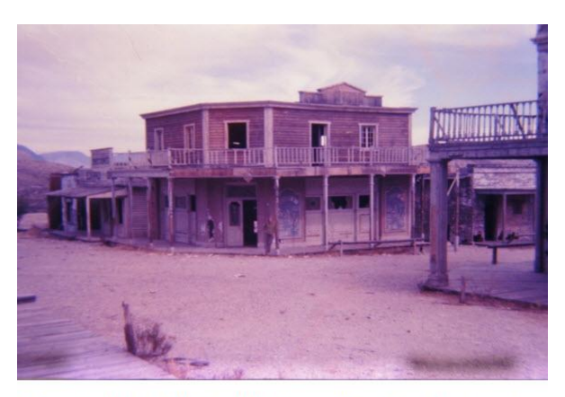
Town built for filming Westerns. Bonnie is leaning on the support post, center of picture, at the entrance

Not thinking of the destination but what was between here and there we had some good times. During the drive, we came across what we thought was a ghost town, but while walking around imagining its history, things just did not look right. It turned out to be a