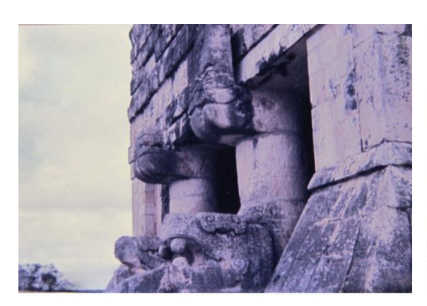
This was the first picture I took in 1972

understood why. There were massive buildings spread out over a large area and each had a purpose, including the ballpark. The ballpark served two purposes: the game, sort of a vertical ring of basketball, and the honor to die in a ceremony for one of the gods if you lost. They believed with this death you would go straight to paradise without having to ascend slowly in increments like everybody else. I guess elsewhere getting your heart ripped out while still alive and beating was the equivalent—here it was simply losing you head.