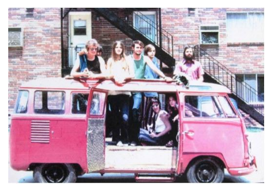
Sandy took this picture of my VW van with friends just before leaving. See the sub-floor.

This buildout would consist of a deck twelve inches above the floor with hinged double doors accessing a lower space: providing a flat surface on top for sleeping and storage for food, water, and supplies below. Finishing it off with carpet on the floor and double doors would give it a living room quality.